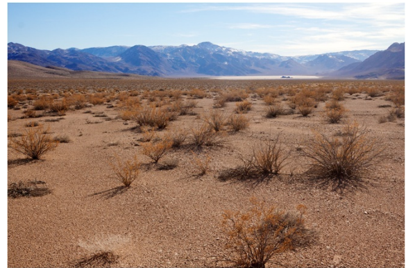
Figure 6 Winner: landscape ecology and ecosystems. "An endorheic basin in Death Valley, California. Although annual precipitation rarely exceeds 100 mm/yr, a small number of plants are able to survive on the gravelly slopes of the valley and on the muddy lakebed. Thousands of years ago this valley would have been far more wet and lushly vegetated."

This moment, the first report of a parasitoid attacking Camponotus morosus , or any Camponotus ant in Chile,